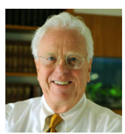
2018 Outstanding Achievement Award Recipient

Register Today! (http://files.constantcontact.com/f4e9dba3201/c33bae96-6519-4ac3-99ce-7c991967011f.pdf)